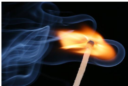
Figure 2: Chemical Properties. The fact that this match burns is a chemical property of the match.

Chemical properties are characteristics of matter that describe how matter changes form in the presence of other matter. Does a sample of matter burn? Burning is a chemical property. Does it behave violently when put in water? This reaction is a chemical property as well (Figure 2). In the following chapters, we will see how descriptions of physical and chemical properties are important aspects of chemistry.