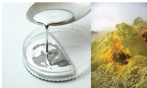
Figure 5: Semimetals. On the left is some elemental mercury, the only metal that exists as a liquid at room temperature. It has all the other expected properties of a metal. On the right, elemental sulfur is a yellow nonmetal that usually is found as a powder.

Some elements have properties of both metals and nonmetals and are called semi-metals (or metalloids). We will see later how these descriptions can be assigned rather easily to various elements.