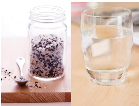
Figure 4: Types of Mixtures. On the left, the combination of two substances is a heterogeneous mixture because the particles of the two components look different. On the right, the salt crystals have dissolved in the water so finely that you cannot tell that salt is present. The homogeneous mixture appears like a single substance.

A homogeneous mixture is a combination of two or more substances that is so intimately mixed, that the mixture behaves as a single substance. Another word for a homogeneous mixture is a solution. Thus, a combination of salt and steel wool is a heterogeneous mixture because it is easy to see which particles of the matter are salt crystals and which are steel wool. On the other hand, if you take salt crystals and dissolve them in water, it is very difficult to tell that you have more than one substance present just by looking—even if you use a powerful microscope. The salt dissolved in water is a homogeneous mixture, or a solution (Figure 4).