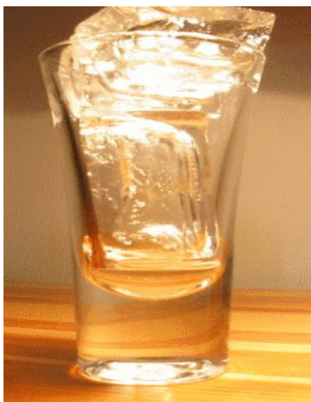
Figure 3: Physical Changes: The solid ice melts into liquid water—a physical change. A time-lapse animation of ice cubes melting in a glass over 50 minutes.

A physical change occurs when a sample of matter changes one or more of its physical properties. For example, a solid may melt (Figure 3), or alcohol in a thermometer may change volume as the temperature changes. A physical change does not affect the chemical composition of matter.