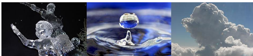
Figure 1: The Phases of Matter. Chemistry recognizes three fundamental phases of matter: solid (left), liquid (middle), and gas (right).

Physical properties are characteristics that describe matter as it exists. Some physical characteristics of matter are shape, color, size, and temperature. An important physical property is the phase (or state ) of matter. The three fundamental phases of matter are solid, liquid, and gas (Figure 1).