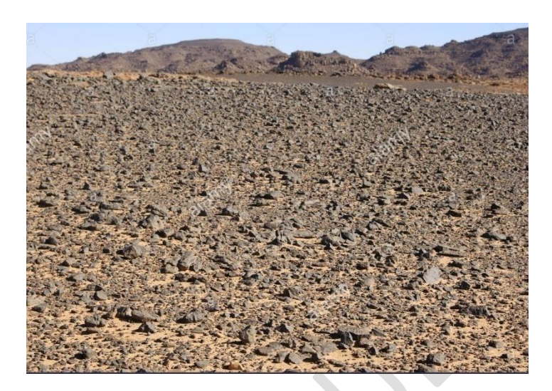
Hamada in the Algerian Sahara

Hamada or hammada is a high plain or desert plateau where deflation has removed fine-grained surface materials and left the sand-swept bedrock with or without pebble veneer or strewn with rocks. The Arabic word hamada means literally a flat rocky surface.