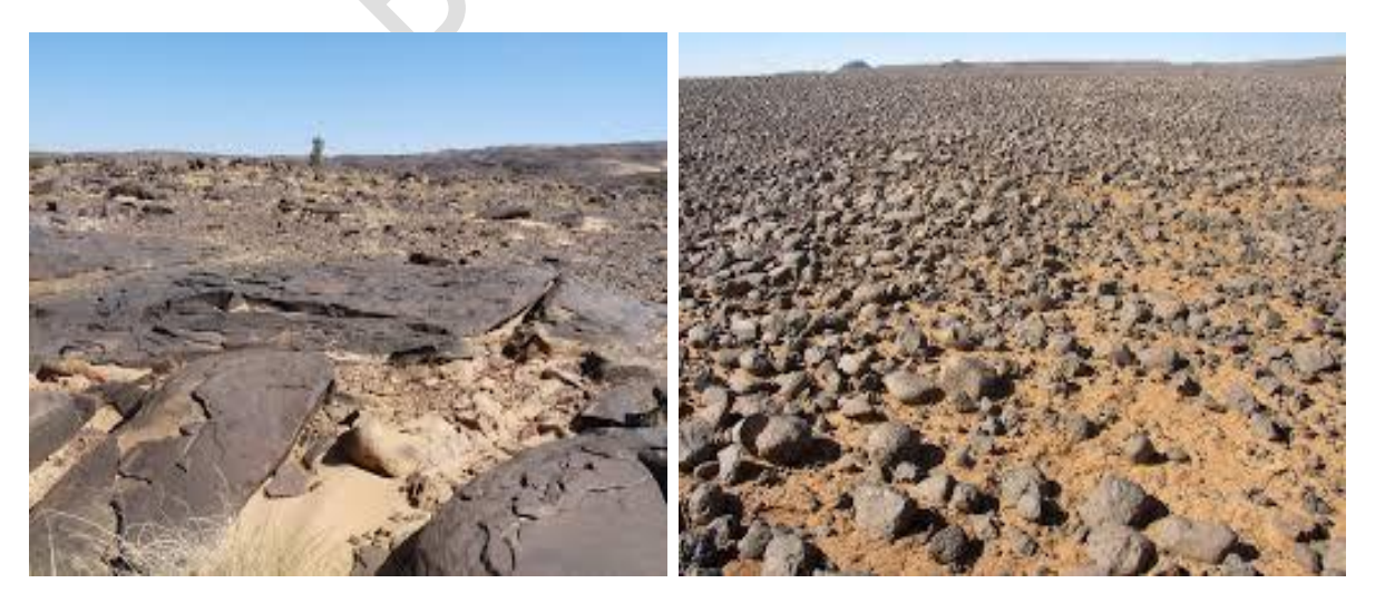
A Reg in the Adrar region of Algeria

A reg is a desert of stones, a stony surface cleared of fine elements by the wind (wind deflation). It corresponds to eroded bedrock or ancient layers of pebbles. Reg is the most widespread type of desert landscape, consisting of expanses of gravel and pebbles rounded by wind erosion. Very little vegetation survives.