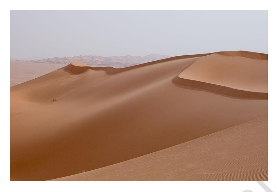
Erg Awbari dune (Fezzan, Libya)

The erg is the sandy desert, the end product of erosion (only 20% of the Sahara's surface).